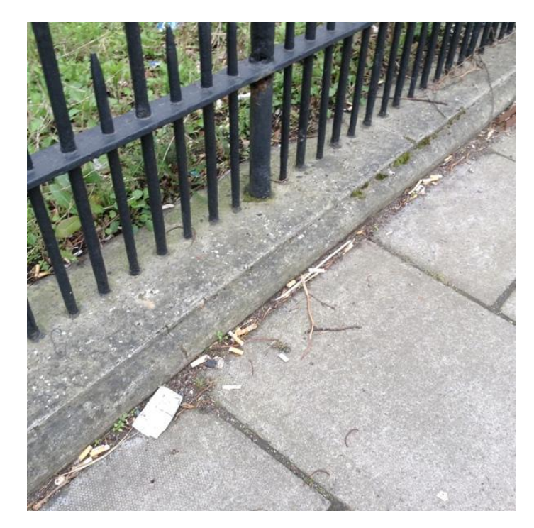
Grade C These areas show accumulations of litter at back lines, kerbs and in between parked cars. There were 29 (7%) Grade C streets observed within the March 2016 assessment.