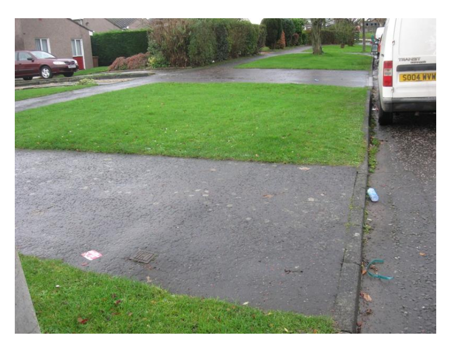
Grade B These areas are clean apart from a few small items of litter. There were 352 (79%) Grade B streets observed within the March 2016 assessment.