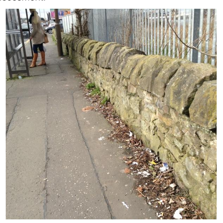
Grade D Streets are visibly and obviously heavily littered, with significant litter and refuse items. There were 2 (1%) Grade D assessments observed in the March 2016 assessment.

2.5 The Confirm on Demand asset and works order management system enables a real-time two way flow of information and allows enquiries from the public to be directed straight to the Task Force workforce using smart phones and tablets. A performance and information framework has been developed which allows local issues and trends to be monitored and this information can be used in tandem