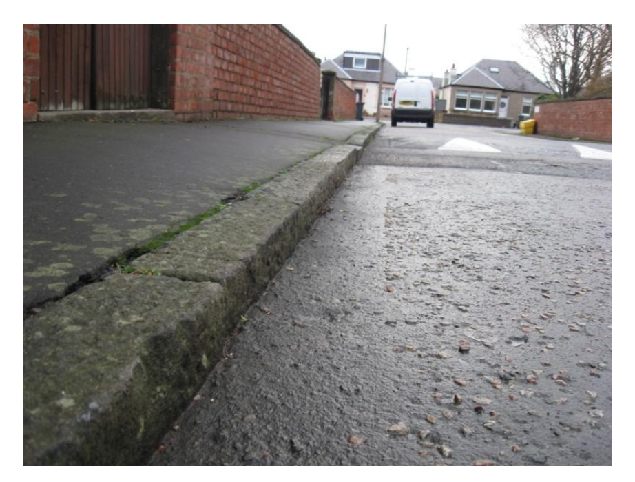
Grade A These areas have no litter or refuse on the street, on the pavement, in gutters or at back lines. There were 52 (12%) Grade A streets observed within the March 2016 assessment.